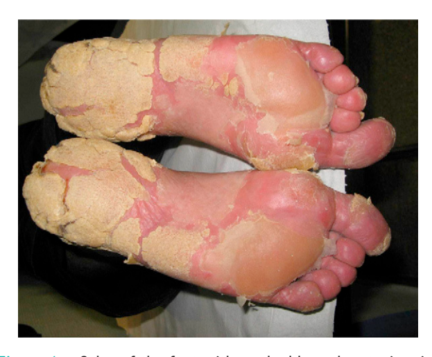
Figure 1 Soles of the feet with marked hyperkeratosis prior to treatment.

The patient presented at our hospital with severe palmoplantar hyperkeratosis, fissuring, and 100% involvement of the palms and soles; it was difficult for him to walk and carry out his daily activities (Fig. 1). There were no other lesions or joint involvement. Treatment with acitretin 50 mg/d (weight 76 kg, 0.66 mg/kg) resulted in some improvement, but was poorly tolerated because of dry skin, cheilitis, joint pain, gynecomastia, alopecia, and