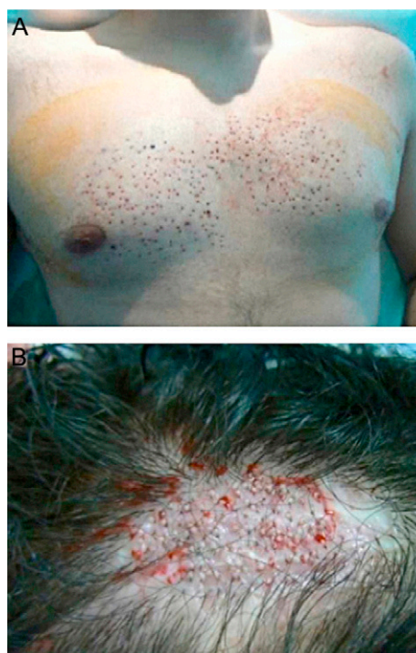
Figure 2 (A) Donor strip on the chest after follicular unit extraction. (B) Implantation of follicular units of body hair in the scar.

Of the 335 follicular units obtained, 100 were implanted in the scar of the parietotemporal area to evaluate the