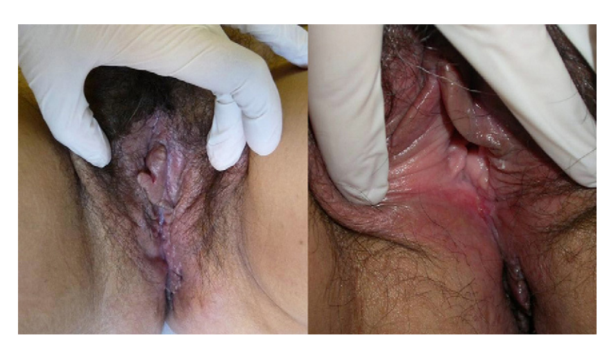
Figure 3 Edematous vulvar mucosa, with a granulomatous appearance. Erosions on the inner surface of the labia minora.

Orofacial granulomatosis or cheilitis granulomatosa, considered a monosymptomatic form of Melkersson-Rosenthal syndrome, shares some of the clinical and histological features of the anogenital granulomatosis in our 2 cases. Cheilitis granulomatosa presents as persistent and recurrent labial swelling; nonnecrotizing granulomas are sometimes associated with ulceration and gingival hyperplasia or cob-