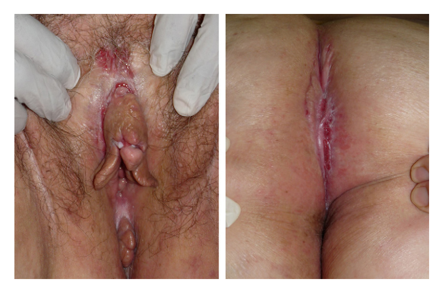
Figure 1 Vulva, showing numerous ulcers, fissures arranged longitudinally in the folds, and edema of the labia majora, labia minora, and clitoral hood. In the gluteal cleft, excrescent plaques with a pseudocondylomatous appearance and longitudinal cracks.