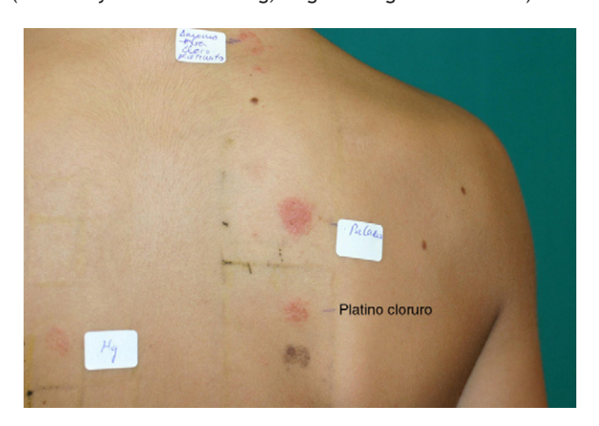
Figure 2 Sensitization to palladium, platinum, mercury, and ammonium tetrachloroplatinate.

aluminium (adjuvant in vaccines and hyposensitization extracts, deodorants, and tattoos); zirconium (deodorants); titanium (pacemakers); nickel (sternotomy suture material); mercury, chromium, and cobalt (mainly tattoos).<sup>3</sup>