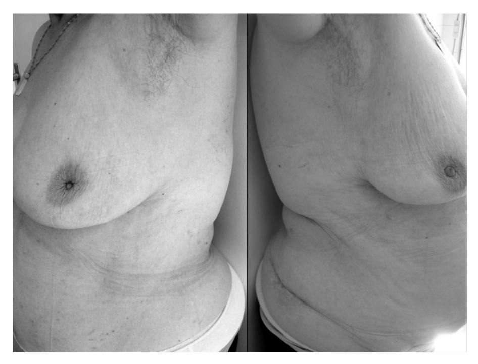
Figure 2 Complete resolution of the lesions after 2 weeks.

She provided a sample of the mushrooms she had ingested prior to the appearance of the lesions. They belonged to the shiitake species ( L.\ edodes ), though it was unclear whether they had been imported (Fig. 3). The mushrooms were refrigerated and later used to carry out, in the patient and 10 healthy controls, Finn Chamber epicutaneous patch tests and scratch tests in which a Microlance 3 needle ( 0.5 \times 16 \, \text{mm} ) was used to prepare the surface of the skin without causing bleeding. The results were read 2, 48 and 72 hours after test administration. The patient's scratch test was positive at 48 and 96 hours, when it displayed marked erythema and vesiculation (Fig. 3), but her patch tests were negative. None of the controls had positive reactions in either hypersensitivity test.