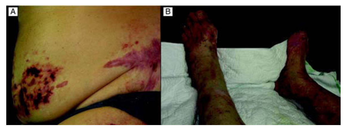
Figure 3 Residual lesions, from previous flare-ups, on the abdomen and flank (A) and on the legs, with amputation of the toes of the right foot (B).

pulse cyclophosphamide therapy. While these treatments had generally kept the disease under control, the patient periodically (every 1 to 2 years) developed flare-ups that required hospitalization.