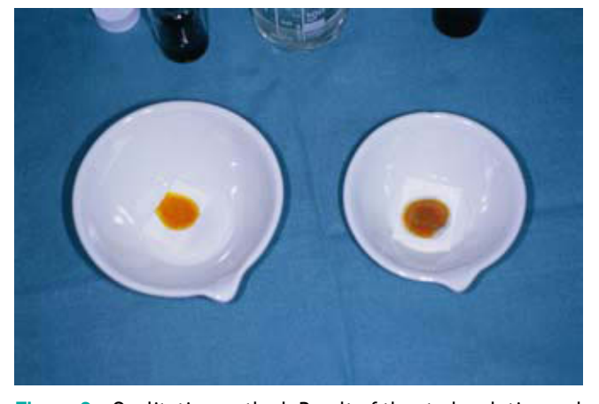
Figure 2 Qualitative method. Result of the study solution and comparison with the control. PPD indicates parapheny-lenediamine.