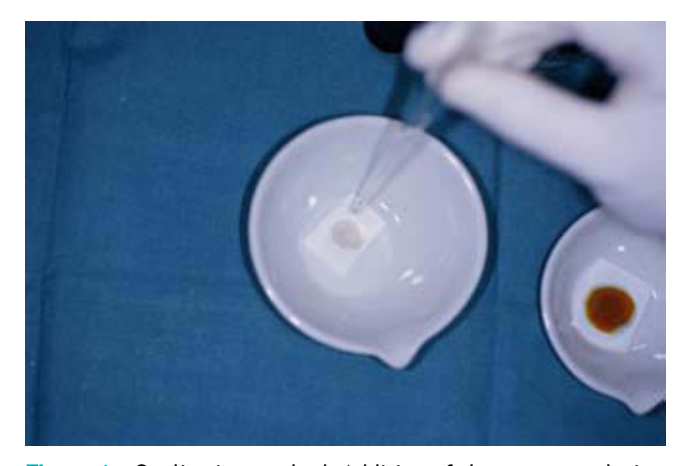
Figure 1 Qualitative method. Addition of the reagent solution to the study solution.

In the next stage of the process, 1 \mu L of each study solution was added to a silica chromatography plate. The solutions were taken from the supernatant and from each of the PPD concentrations used as controls and spotted at several points. The silica plate was placed in a