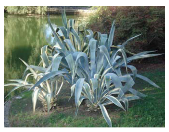
Figure 1 Agave americana.

Few cases of contact dermatitis caused by the components of Agave americana sap have been reported. <sup>1-3</sup> This condition usually presents with very rapid onset of intense itching and burning associated with the appearance of marked erythema and edema in the affected area. Papular and vesicular lesions with a linear distribution following the trajectory of the splashing then develop. Purpuric lesions such as those appearing in our case have only been