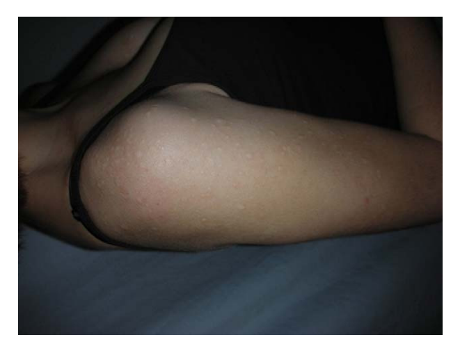
Figure 2 Nonconfluent whitish papules on the shoulders.