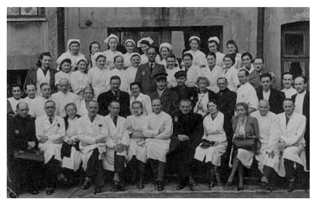
Figure 2 Lodz, Poland. Members of the ghetto hospital staff.

In just 12 days during August 1942, 50 000 people—half the population of the ghetto—were transported. In any case, the ghetto was completely eliminated in June of the following year.<sup>7</sup>