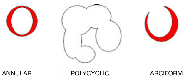
Figure 1 Patterns of figurate erythema.

Many skin conditions appear as annular lesions. Some are more typically found in adults or older children, whereas others usually appear in infancy. Although ringworm is the most common annular skin condition in very young children, other skin diseases should be included in the differential diagnosis (Table 1). The following review covers the conditions known as annular or figurate erythemas