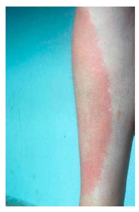
Figure 2 Erythema chronicum migrans on the leg days after a tick bite.

Abbreviations: ASLO, antistreptolysin O; CRP, C-reactive protein; ESR, erythrocyte sedimentation rate.