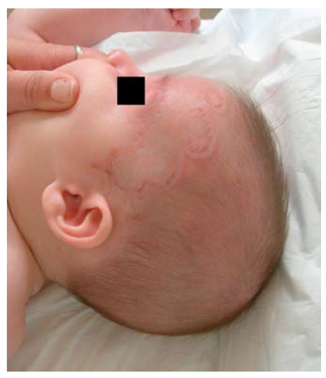
Figure 4 Erythema gyratum atrophicans transiens neonatale in an infant. Note the atrophy in the center of the lesion and the raised border.

Martin et al<sup>13</sup> reported on the long-term follow-up of 49 children with neonatal lupus and their 45 unaffected siblings. Six of the children had rheumatic or autoimmune disease. The results of the 55 serology tests performed were positive for antinuclear antibodies in 4 children (2 in 33 affected children and 2 in 22 healthy siblings) and negative for anti-Ro/SS-A antibodies and anti-La/SS-B antibodies in all the children. These data suggest that a small percentage of these patients could develop systemic lupus erythematosus or other autoimmune diseases during adulthood; therefore, they should undergo periodic evaluation to establish diagnosis and early treatment where necessary.<sup>13</sup>