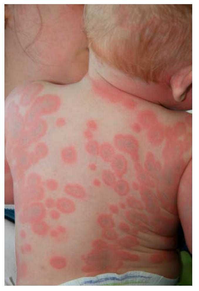
Figure 7 Acute annular urticaria in an infant. Note the annular purpuric maculopapules.

Histopathology reveals a perivascular lymphocytic infiltrate with the presence of abundant neutrophils in the interstitium and leukocytoclasia. There are no signs of vasculitis. The clinical characteristics, outcome, and