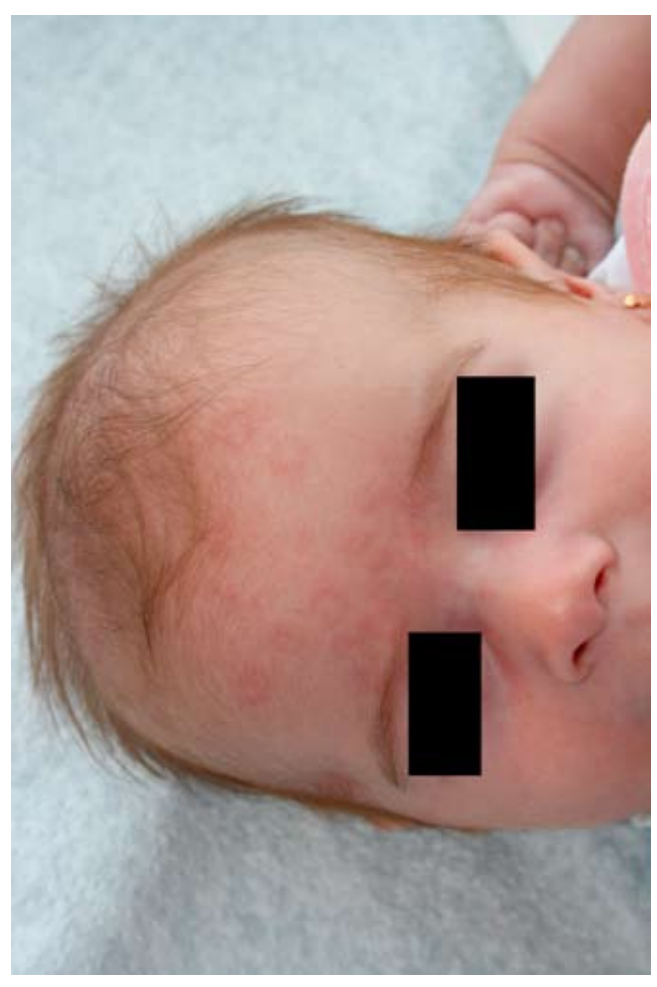
Figure 3 Neonatal lupus. Characteristic annular lesions on the forehead and scalp.

As for treatment of the cutaneous manifestations, although this disease is self-limiting, we stress the importance of sun protection measures in children with this complaint. Low-to-medium potency corticosteroids may be beneficial.