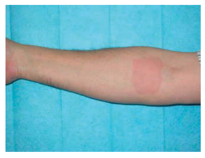
Figure 2 Wheal-like plaque on the right arm after applying an ice cube.