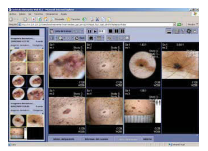
Figure 3 Retrieval of dermatological images taken at different times of a single patient from the Picture Archiving and Communication System using Centricity Web.

A PACS offers many advantages as a storage system for dermatological images (Table 2). First, image information loss is kept to the minimum. We can also immediately access images at any time and from any hospital computer. Searches can be based on multiple variables, including diagnosis, making it simple to prepare clinical sessions and teaching applications.