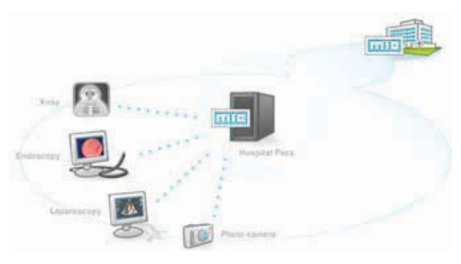
Figure 1 Model of a multidepartmental Picture Archiving and Communication System.

Subsequently, the web-based viewer Centricity PACS (GE Healthcare, Little Chalfont, UK) (Figure 3) can be used to retrieve the images from the patient's electronic medical record or through a web application that enables searches based on multiple parameters (patient data, type of test, physician, date, diagnosis, etc). Furthermore, images taken at different times can be compared to monitor progress.