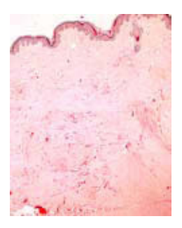
Figure 2 Nonencapsulated dermal tumor formed of interwoven fascicles. Hematoxylin-eosin, ×10.

Laboratory tests including complete blood count, biochemistry, and tumor markers were normal. Abdominal ultrasound was performed, showing no significant abnormalities.