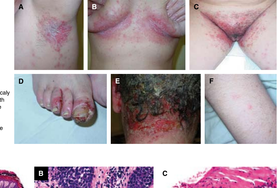
Figure 1. A, B, and C. Scaly erythematous lesions with isolated pustules in large folds. D. Interdigital and periungual folds. E. Pustular and exudative plaques in the scalp. F. An intact pustule.

A number of skin biopsies were conducted, revealing psoriasiform hyperplasia of the epidermis, small subcorneal spongiform pustules with exocytosis of the neutrophils, and a mixed infiltrate in the upper and