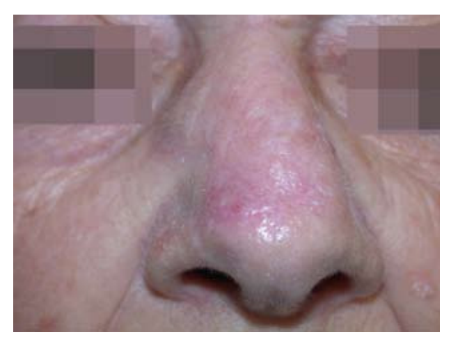
Figure 3. Healing of the partial necrosis by second intention.