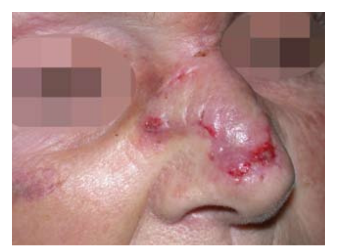
Figure 2. Distal partial necrosis in a bilobulate flap in the nasal area.