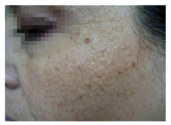
Figure 1. Millimetric, skin-colored papules on the left cheek and temporal region.

The women presented numerous depressed pinpoint scars and multiple, hard, asymptomatic, skin-colored papules of 2 to 3 mm in diameter (Figures 1 and 2). There were no other significant clinical findings.