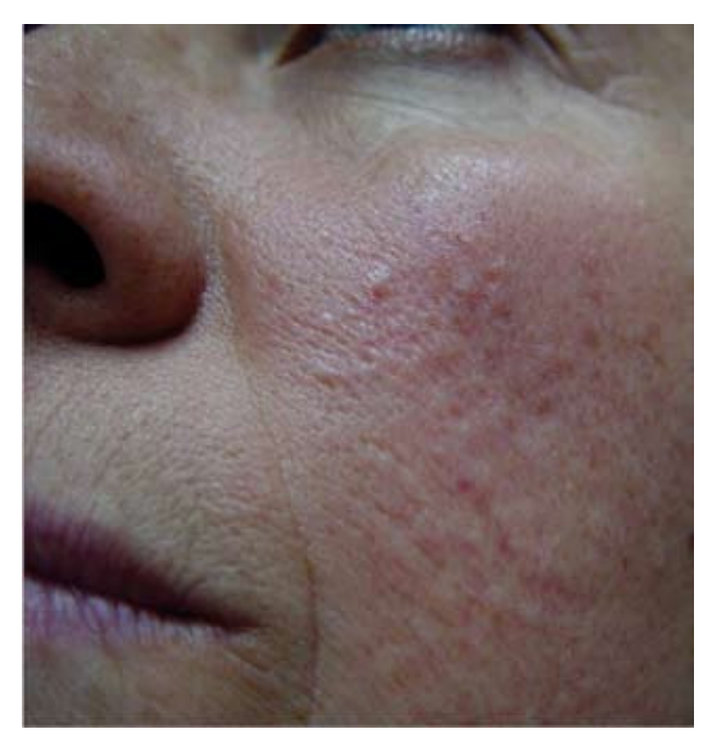
Figure 2. Numerous hard papules on the left cheek.

In the absence of a tissue lesion, ectopic deposits of calcium salts develop when the calcium phosphate product in plasma exceeds 70 mg/dL.<sup>3</sup> If tissue damage is present, it has been suggested that the following pathogenic phenomena may play a role: increased intracellular calcium concentration, denaturation of proteins that preferentially