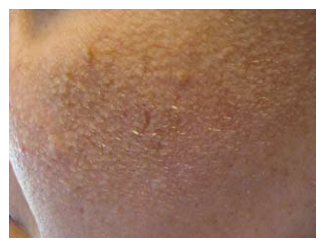
Figure 1. Multiple, filiform, follicular hyperkeratotic lesion on the left cheek.

Hyperkeratotic spicules are rare skin lesions of unknown origin, defined by the presence of multiple areas of circumscribed hyperkeratosis formed of keratotic material that protrudes from the stratum corneum.<sup>1</sup> The