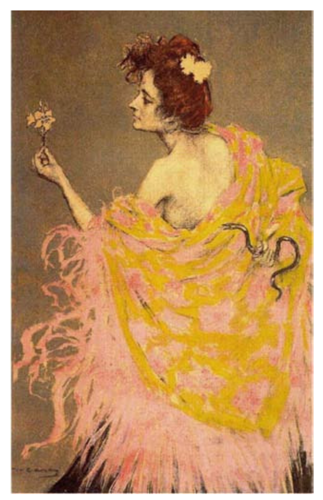
Figure 4. "Syphilis," by Ramón Casas.