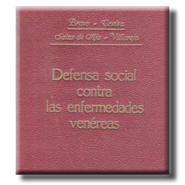
Figure 1. Cover of the book.

Palabras clave: historia, profilaxis, sífilis.