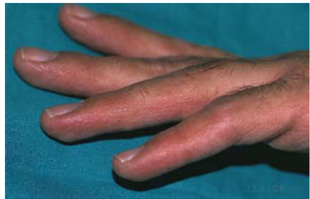
Figure 1. Papular lesions on the lateral borders of the fingers

Elastosis perforans serpiginosa and reactive perforating collagenosis are diseases of unknown origin, although there may be a hereditary factor. Elastosis perforans serpiginosa may be associated with Down syndrome and connective tissue diseases; it is characterized by keratotic papules of 2 to 5 mm that tend to be organized in a serpiginous or