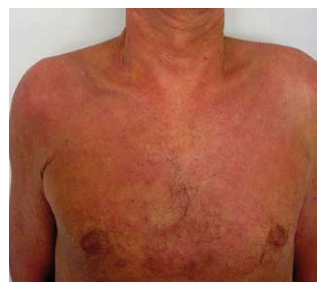
Figure 1. Maculopapular rash after starting therapy with amoxicillin-clavulanate in a patient infected with the human immunodeficiency virus.

HAART has generally been associated with 3 main cutaneous effects: lipodystrophy syndrome, retinoid-like effect, and immune reconstitution dermatosis, all of which are discussed below.