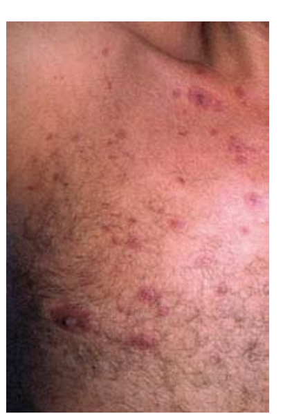
Figure 9. Target lesions characteristic of the Stevens-Johnson syndrome. Symptoms appeared after initiation of nevirapine.

symptoms quickly and prevent an increase in morbidity among HIV-infected patients.