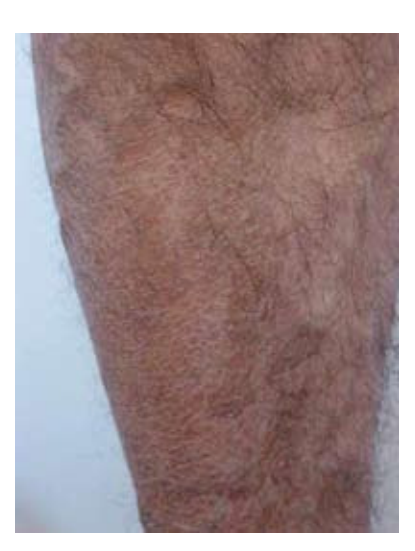
Figure 6. Cutaneous xerosis is another phenomenon that presents in patients infected by human immunodeficiency virus, and it is often linked with antiretroviral treatment.