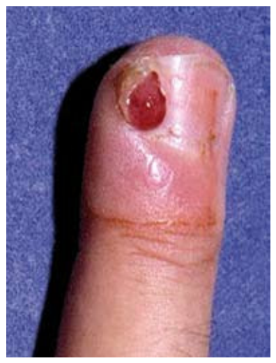
Figure 5. Pyogenic granulomatous lesions are a retinoid-like phenomenon that has been reported in association with antiretroviral treatment, especially indinavir.

There is some confusion in the literature about which drugs are responsible for this clinical picture and about how the symptoms should be classified. (At the first international conference on lipodystrophy held in San Diego, USA, in 1999, nail disorders and cheilitis were considered part of the lipodystrophy syndrome.) Furthermore, attributing an association of a drug with phenomena as common as dry skin, pruritus, or onychocryptosis often seems arbitrary