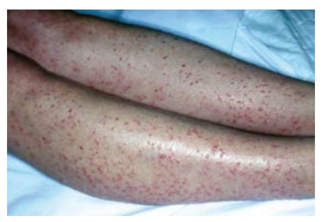
Figure 1. Eruptive clear cell acanthoma on the legs.

CCA is generally solitary and multiple forms are uncommon. However, there is one isolated description in the medical literature of an eruptive form of the disease with more than 400 lesions.