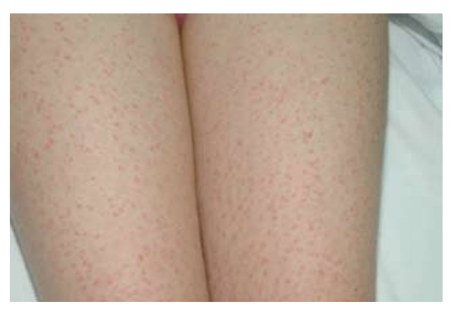
Figure 2. Multiple clear cell acanthomas on the thighs.

These 30 cases include isolated incidences of patients with more than 100 lesions distributed across the trunk and limbs.<sup>8</sup> However, we have only found one case similar