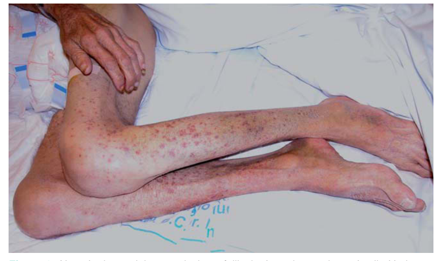
Figure 1. Note the large violaceous lesions, follicular hyperkeratosis, and coiled hairs observed in our patient.

violaceous cutaneous lesions on the legs and abdomen (Figure 1). His personal history included several episodes of hemarthrosis and flare-ups of hematuria in the previous 2 years that had not been specifically diagnosed. Dermatoscopy of the cutaneous lesions revealed a pale orange perifollicular halo surrounded by peripheral hemorrhagic another violaceous halo, along with "corkscrew" hair and follicular hyperkeratosis (Figure 2). A skin biopsy showed a ringlet-like hair shaft sectioned at different levels inside the follicle, compact perifollicular fibrosis, and extravasated erythrocytes in the dermis, but not in the perifollicular fibrotic area mentioned above (Figure 3).