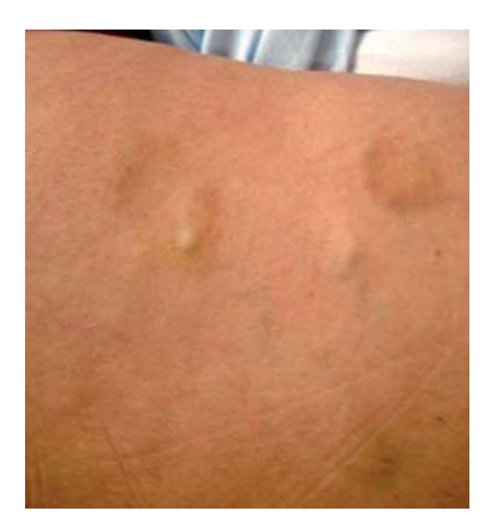
Figure 1. Subcutaneous contusiform nodules.

Immunohistochemistry was negative for CD20, multiple myeloma-1, B-cell lymphoma-6, CD3, terminal deoxynucleotidyl transferase, and Human herpesvirus (HHV)-8. However, tumor cells were positive for plasma cell markers such as CD138, and there was a high proliferation index. The Epstein-Barr virus encoded RNA (EBER) marker of EBV was positive using in situ hybridization techniques. A diagnosis of PL was made based on these results.