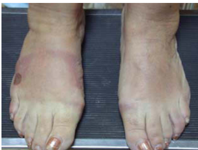
Figure 1. Blisters on the lateral aspects of the right foot with linear erythema on the dorsum of the foot. Residual lesions were also observed. No lesions were apparent on the other foot.

The patient eventually noticed that the lesions were related to the use of shoes that had been dyed 2 months previously. The dye had stained the internal sides of the right shoe (Figure 2), exactly where the blisters had