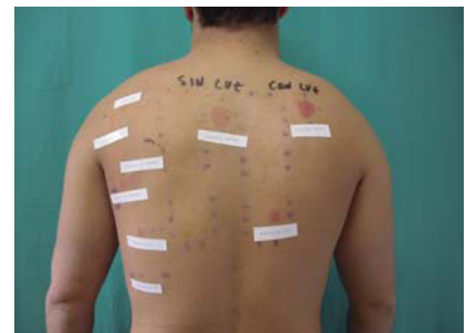
Figure 1. Results of patch and photopatch testing.

promethazine was capable of photosensitization, with eczematous lesions in areas exposed to light; however, the studies were not rigorous and no photopatch tests were done. In Scandinavia, a multicenter study was conducted between 1980 and 1981, collecting the results from 745 photopatch tests. 5 Of these, 24 were positive for promethazine, most of them due to phototoxicity. In the study by Goossens et al, 4 in 2 of the 14 patients with a positive reaction to promethazine photosensitization to this drug was also observed. The Spanish Photobiology Group recently published the results of photopatch tests at 7 Spanish hospitals