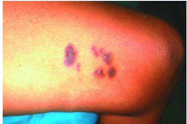
Figure 1. Violaceous erythematous nodules on the internal aspect of the left thigh measuring 2 mm to 7 mm in diameter. They exhibited an arcuate distribution and were firm on palpation.

The patient was a 45-year-old man with known HIV infection in stage B2 who had been taking antiretroviral treatment for 1 year. On admission, his total CD4 lymphocyte count was 250 cells/mm 3 . He was being treated in the gastroenterology department due to upper digestive tract bleeding caused by esophageal varices. The patient was referred to the dermatology department because of multiple cutaneous lesions on the legs suggestive of possible Kaposi sarcoma. The patient was also suffering from cirrhosis of the liver caused by hepatitis C virus and hepatocellular carcinoma that had been diagnosed 6 months before the