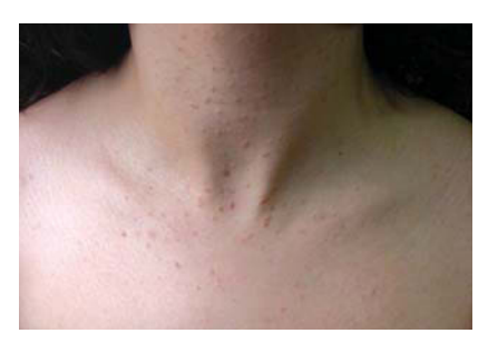
Figure 1. Multiple asymptomatic pink papules at the neckline and anterior region of the neck.

Syringomas are benign adnexal tumors of eccrine ductal origin, characterized by small, firm, rounded, flesh-colored or yellowish papules located on the eyelids, anterior region of the neck, trunk, or abdomen. The highly characteristic histology consists of an epithelial growth in the form of tubules or nests made up of 2 flat cell layers; these structures develop a "tadpole-shaped" tail. The most widely used treatment is ultrapulsed CO<sub>2</sub> laser, although no studies have confirmed its