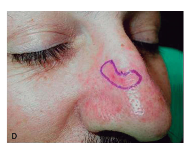
Figure 2. A, Basal cell carcinoma on the dorsum of the nose. B, Clinical margins. C, Margins by fluorescence. D, Reduction of the area of excision.

have also been reported. These effects are considered to be less pronounced than those caused by 5-fluoracil. Allergic reactions have been reported, though these are very rare.