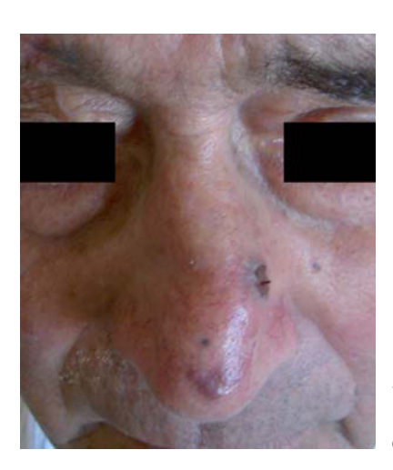
Figure 1. Violaceous tumorous lesions of the nasal dorsum.

Manuscript accepted for publication January 29, 2007.