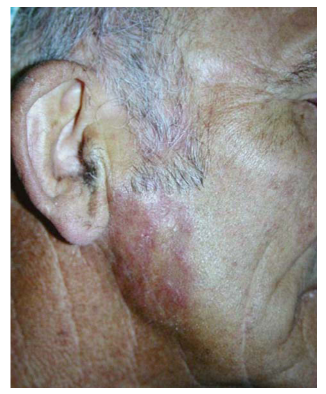
Figure 2. Indurated plaque with atrophic appearance in the right mandibular region.

The patient reported previous involvement of the left upper eyelid that had resolved spontaneously.