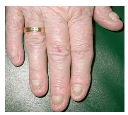
Figure. Yellowish discoloration, nail shortening and thickening, and increased curvature of the nail layers.

Treatment of the systemic manifestations and associated diseases improves the nail symptoms.