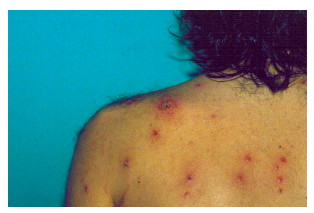
Figure 1. Multiple lesions on the back.