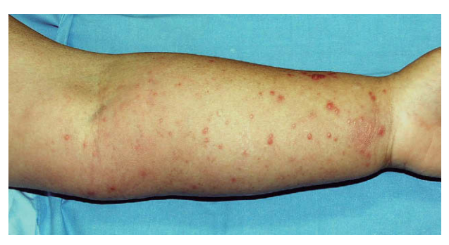
Figure 1. Erythematous papules on the arm.