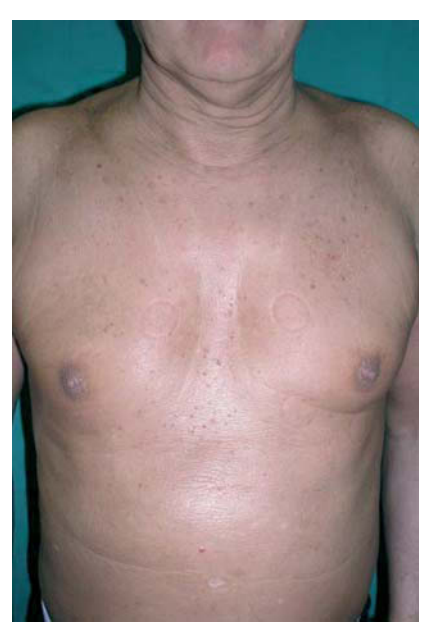
Figure 2. Patient's skin after treatment of both neoplasms. The erythema and cutaneous thickening seen in the previous images and seborrheic keratoses have disappeared.

aspirate culture, he was diagnosed with Sézary syndrome. At that time, more than 100 hyperpigmented, keratotic papules of 1 to 2 cm and soft to touch