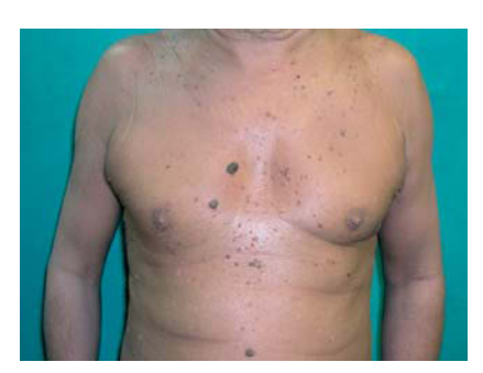
Figure 1. Numerous grayish papules on the thorax and abdomen with erythroderma and cutaneous thickening.

We describe a 63-year-old man diagnosed with plaque-stage mycosis fungoides who, during phototherapy, developed severe erythema and generalized skin thickening (Figure 1) accompanied by severe pruritus. Based on the skin biopsies, computed tomography scan, and bone marrow