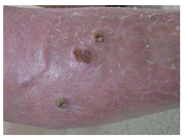
Figure 4. Evolution of cutaneous lesions with extensive perilesional inflammation.