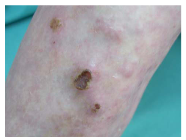
Figure 1. Grouped erythematous nodules with superficial ulceration on the front surface of the leg.