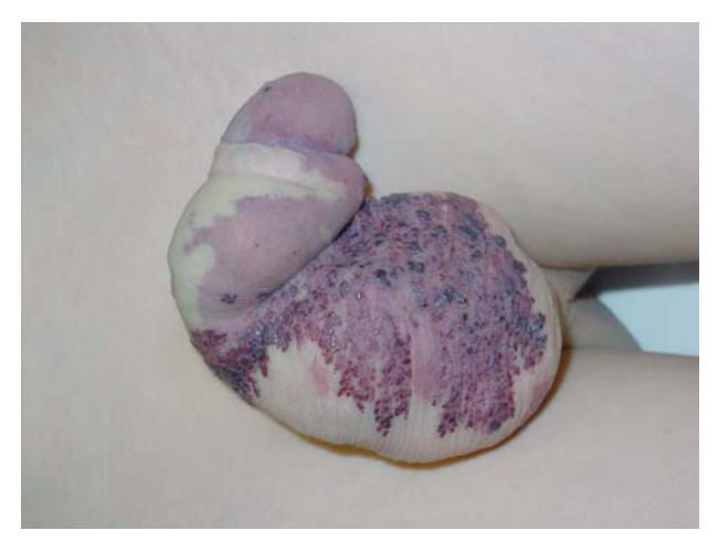
Figure 17. Venous-lymphatic malformation with genital involvement. Characteristic blackish (hemorrhagic) vesicles on a violaceous geographic stain.