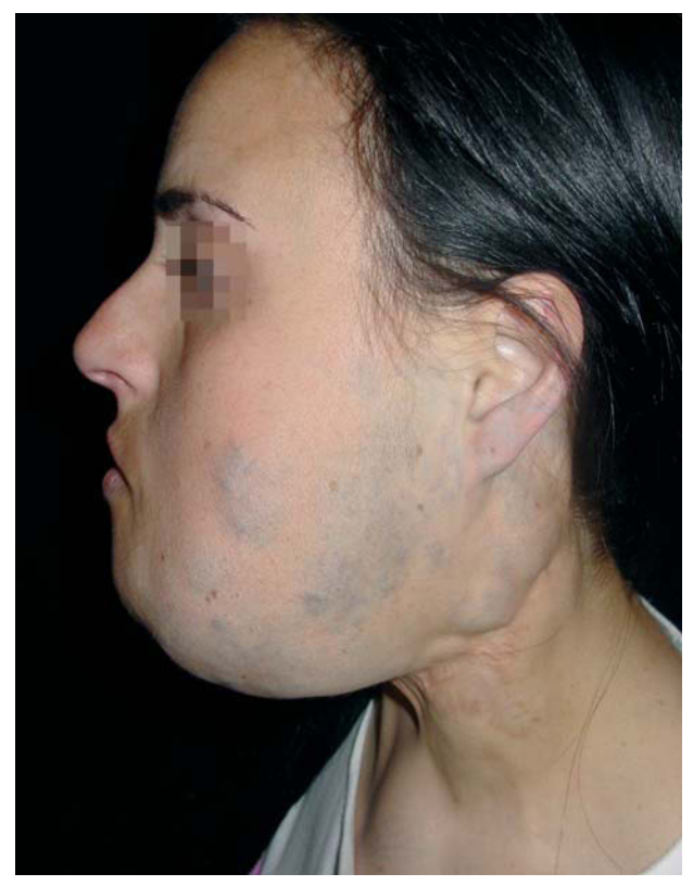
Figure 8. Large venous malformation on one side of the face with spread towards the neck in a young woman. Postoperative scarring can be seen on the neck.