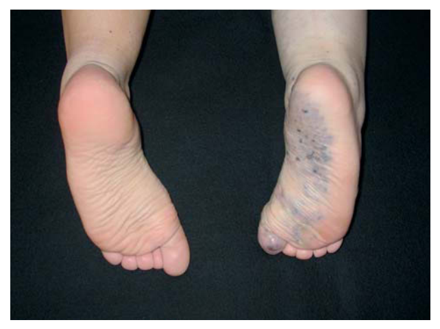
Figure 10. Venous malformation in the leg with plantar involvement. Bone and musculoskeletal atrophy is noted contrary to the usual presentation in combined malformations of the Klippel-Trenaunay type.

Blue rubber bleb nevus syndrome is associated with multiple venous malformations in the skin and gastrointestinal tract. Skin lesions, which are generally present from birth or appear progressively in early childhood, present in the form of small bluish or purplish nodules. At times, they may form more extensive tumors or bluish macules. Characteristically, they are compressible to palpation to form a rubbery bleb. They typically cause spontaneous pain. Within the digestive tract, the most common site of the lesions is in the small intestine. These malformations may cause bleeding in the digestive system with secondary anemia and require endoscopic monitoring and surgery depending on their severity. From the histopathological point of view, the lesions are vascular ectasias with irregular sizes and forms found in the deep dermis and subcutaneous cellular tissue. MRI is useful for diagnosing the extent of visceral involvement and is used for studying asymptomatic family members. Most of the cases published correspond to sporadic mutations, although