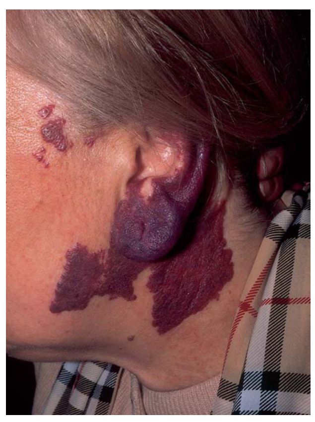
Figure 2. Adult patient with port wine stain. Note the purple coloration and hypertrophy of the pinna.