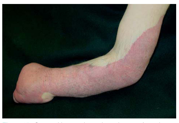
Figure 15. Geographic port wine stain on the arm of a patient with Klippel-Trenaunay syndrome affecting one side of the body. The stain is associated with distal deformity of the affected limb

hypertension responsible for the port wine stain, varicose veins, and hypertrophy of the limb.<sup>86</sup> Although the presentation is sporadic, familial cases with genetic mutations have recently been reported.22,87,88 Venular malformations or port wine stains are usually multiple, generally affecting a lower limb (95% of cases) and often spreading to the glutea and thorax. In more than 10% of patients the lesion extends beyond the limb with involvement of the trunk and may even affect the entire side of the body. A recent publication distinguished between "geographical stains" (irregular well-defined border resembling a continent) with an intense reddish or violaceous color (Figures 14 and 15) and other "blotchy" marks with a segmental distribution and pink coloration (Figure 16). Geographic stains show greater lymphatic involvement and are associated with more complications.<sup>89</sup> The new diagnostic techniques open up new perspectives in patients with Klippel-Trenaunay syndrome. Advances in noninvasive angiographic techniques such as 3-dimensional MRI venography and/or multislice CT venography allow a complete evaluation of these patients from a single image. Using these procedures, we were able to observe how geographic stains are also often associated with hypoplasia or atresia of the deep venous system in a small but significant series of patients.<sup>90</sup>