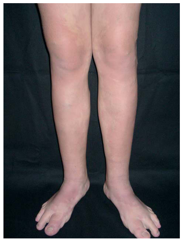
Figure 19. Seventeen-year-old boy with Proteus syndrome. Bilateral port wine stain and hypertrophy of the feet with macrodactyly.

Proteus syndrome is a heterogenous condition defined by the presence of asymmetric vascular, skeletal, and soft-tissue lesions of varying size.<sup>97</sup> Linear verrucous skin lesions, lipomas and lipomatosis, macrocephalia, asymmetric limbs with partial gigantism of the hand, foot, or both, and a plantar cerebriform thickening corresponding histologically to collagenoma can be observed. In a series of 55 patients, 98.2% showed asymmetric body growth and macrodactyly.<sup>98</sup>