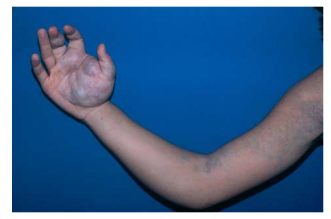
Figure 7. Well-defined venous malformation of the hand that extends diffusely along the upper right arm.

appreciated externally. Muscle is almost always involved, and joints and bones are also often affected. Unlike combined vascular malformations such as Klippel-Trenaunay syndrome, musculoskeletal atrophy or hypotrophy rather than hypertrophy of the affected limb is usually observed (Figure 10). When the knee is affected, gonalgia is common with functional impairment and hemarthrosis. It is not unusual for arthropathy due to hemosiderin to eventually progress to degenerative arthritis. In a series of 176 patients with venous malformations affecting skeletal muscle tissue, the incidence was twice as high in women and two-thirds of the patients had been diagnosed at birth, whereas the remaining ones had been diagnosed during childhood or adolescence. The most common sites were the head, neck, and limbs, and the main symptoms were pain and inflammation.67