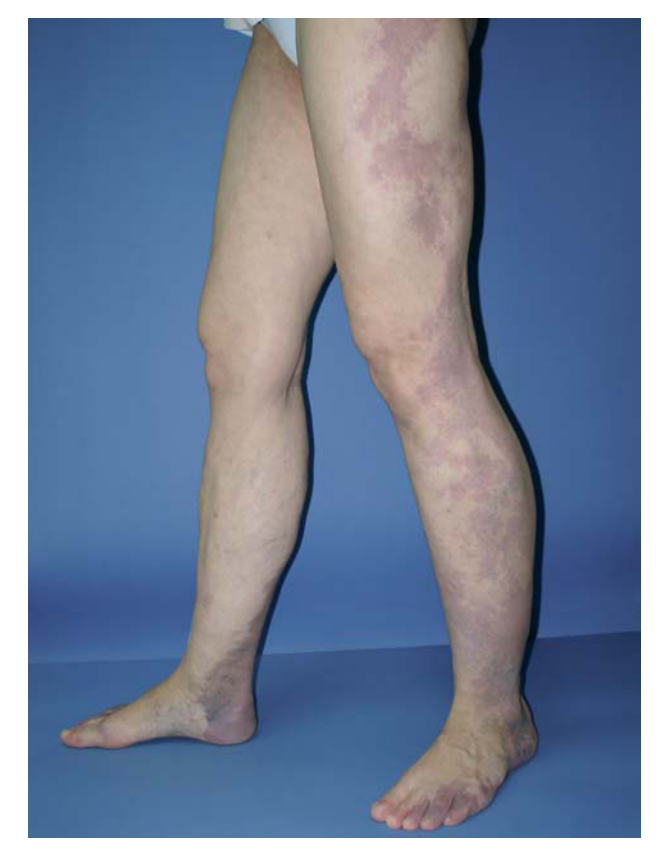
Figure 16. Diffuse port wine stain with poorly defined edges and tenuous coloration on the external aspect of the leg of a patient with Klippel-Trenaunay syndrome.

The increased volume of the affected limb becomes more noticeable with age. Of particularly note is soft tissue