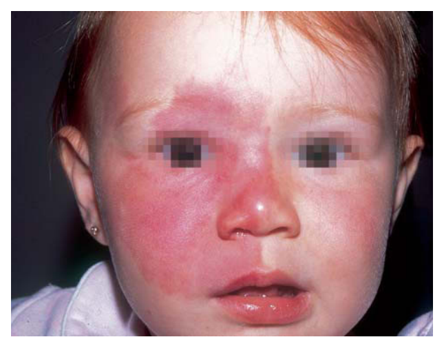
Figure 1. Port wine stain on the right side of the face without exceeding the midline. V1 and V2 involvement.

Port wine stains are located on one or more facial dermatomes defined by branches of the trigeminal nerve. The V2 dermatome is the one most often implicated (57%), followed by the mandibular one (V3), and the ophthalmic one (V1).<sup>37</sup> When more than one dermatome is affected, the most common association is V2 with V1 or V3, accounting for 90% of the cases. The lesion usually shows a geographic confluent morphology, and in such cases response to laser therapy is better than in patchy lesions.<sup>37</sup> When the V2 dermatome is affected, the mucosa adjacent to or close to the cutaneous lesion may be compromised. Mucosa such as the vermillion border, labial mucosa, and maxillary and gingival mucosa tend to be affected in this case. Unlike lesions of the midline, these venular malformations darken and thicken with age, acquiring a more violaceous tone and a cobblestone appearance, although the course may vary among individuals and is much more evident in the head and neck region than at other anatomic sites (Figure 2). They may sometimes be associated with small skeletal changes in the form of bone hypertrophy, particularly when the V2 lesion extends to the gingival and maxillary mucosa. This localized hypertrophy may lead to gaps between the teeth and a striking increased volume of the affected lip that requires surgical correction (Figure 3).