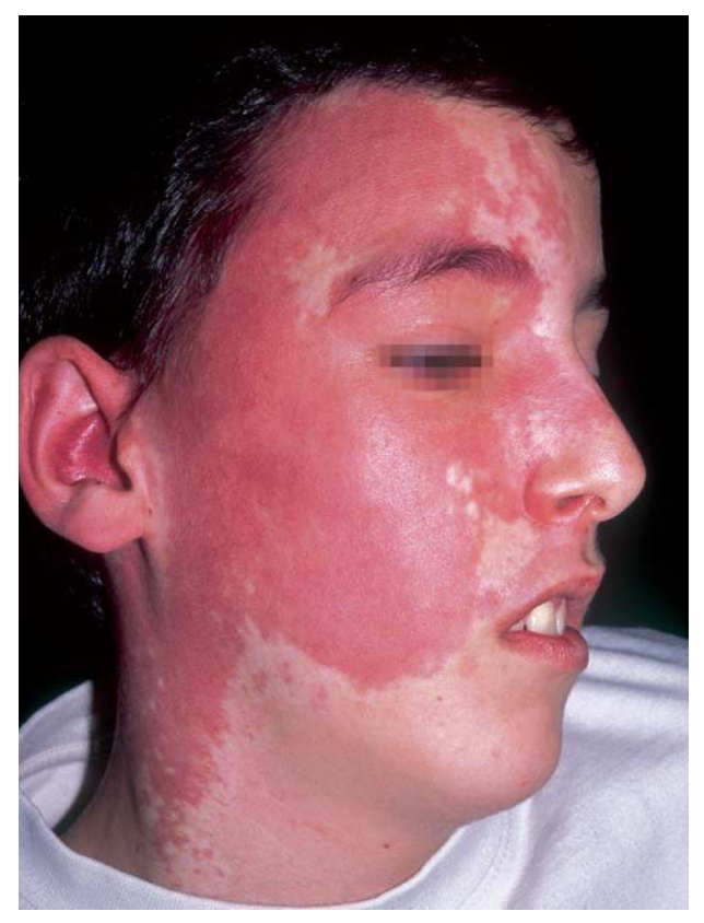
Figure 4. Sturge-Weber syndrome with port wine stain at the V1 and V2 level, glaucoma, and leptomeningeal involvement.

"twin spotting" is a manifestation of mosaicism. Most patients can be classified into 4 types. Type 1 is associated with a venular malformation with melanocytic nevus and verrucous epidermal nevus. In type 2, venular malformation