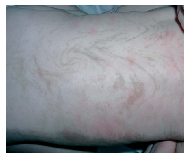
Figure 2. Hyperpigmented maculas with Blaschko line distribution on the back (stage 3).