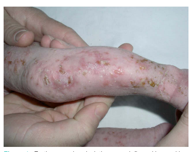
Figure 1. Erythema and vesiculation on an inflamed base with longitudinal linear distribution on the legs (stage 1). Hyperkeratotic verrucous plaque on the knee (stage 2).

Incontinentia pigmenti is a multisystem disorder of Xlinked dominant inheritances, as demonstrated by the fact