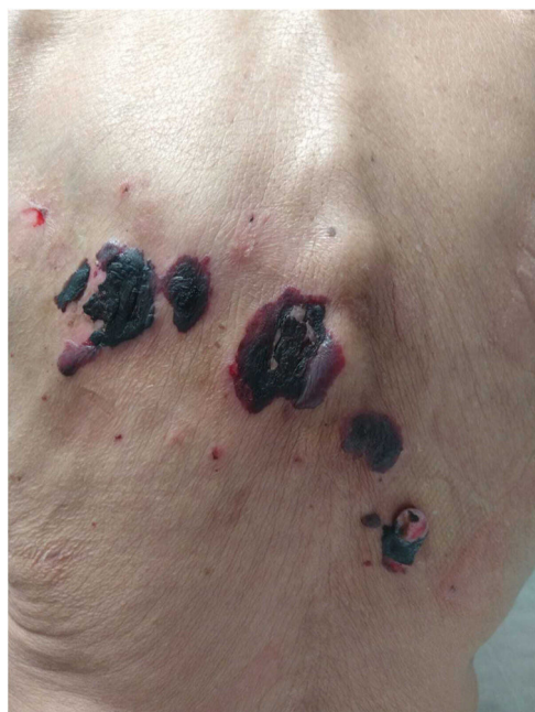
Figure 2 Atypical presentation. Large blisters located on the back, filled with hemorrhagic content revealing wider spread and a more severe condition (case #3).