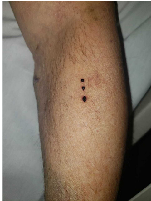
Figure 1 Typical presentation. Tense hemorrhagic blisters with a linear distribution of left forearm location (case #1).

HBD is considered a rare condition, and its incidence is unknown to date. It is more commonly seen in men of advanced age, with a mean age at presentation of 70 years, which is similar to the cases reported. 2,3