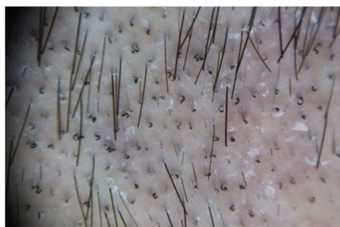
Figure 4 Trichoscopic image of corkscrew hairs, typical of black dot ringworm caused by T. tonsurans .

cases in Spain nor the geographic distribution but rather provide a sufficiently representative sample of cases to define the clinical pattern, etiology, and response to treatment. The outbreak affects almost exclusively young males who frequently shave the back of the head and temporal area in