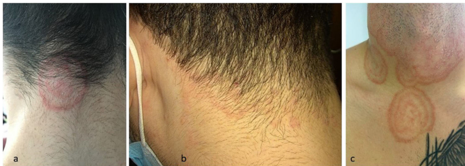
Figure 2 (A, B) Noninflammatory forms. (C) Spread to areas away from the initial site.

Fifty-two patients had not received any prior treatment; 17 (15.8%) had applied topical corticosteroids, either on their own initiative or following prescription by the primary care physician, 16 (15%) applied topical antifungal agents, and 5 (5.6%) took systemic antibiotics. There was a relationship between inflammatory forms and previous corticosteroids use.