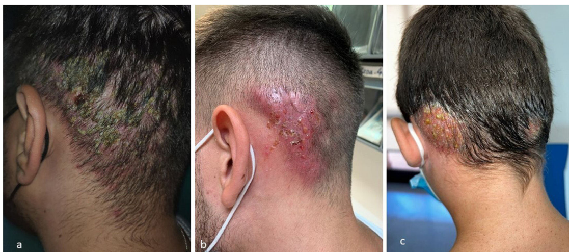
Figure 3 Inflammatory forms.