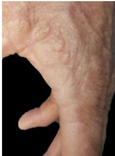
Figure 1 Clinical image. Note the lesions with a nodular appearance at the juncture of the palmar and dorsal skin of the left hand.

The initial diagnosis was colloid milium or acrokeratoelastoidosis. The histology workup of a punch biopsy specimen taken from one of the lesions revealed an epidermis with irregular acanthosis of the interpapillary ridges and a hyperkeratotic stratum compactum. The papillary and superficial dermis were characterized by deposition of abundant eosinophilic material. This was smooth with