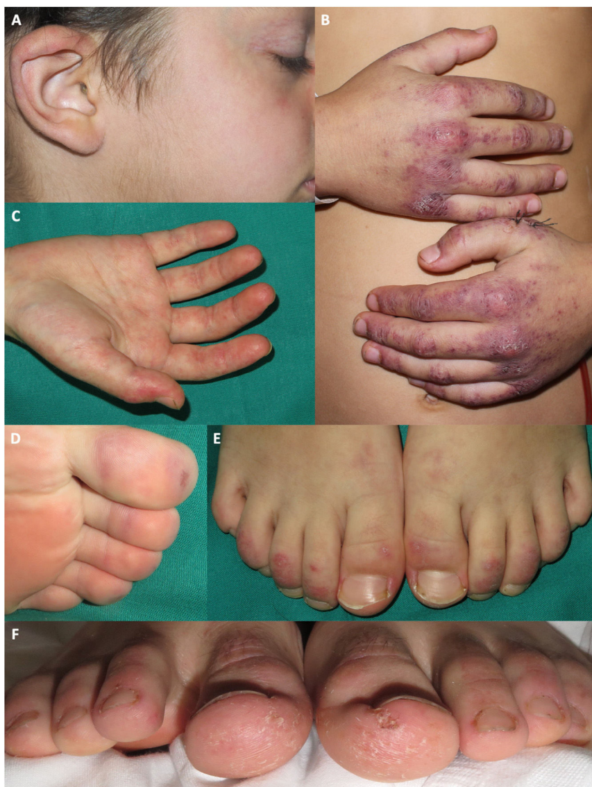
Figure 2 Acral manifestations in patients diagnosed with juvenile dermatomyositis in our hospital during the COVID pandemic. A, Erythematous and purpuric plaques on the ear of a patient who also presented telangiectasias on the eyelids and cheilitis. B, Purpuric erythematous plaques with scaling on the backs of the hands, with more extensive involvement than that observed with typical Gottron papules. C, Palmar erythema. D, Purpuric macules on the toes. E, Erythematous-desquamative plaques on the backs of the toes. F, Erythematous-desquamative plaques on the toes, associated with scaling, fissuring, and ulcer in the plantar region of the toes.

years. None of these patients had a history of infectious disease or vaccination prior to the onset of clinical symptoms. In all cases, the most frequent symptom was asthenia, which presented before the skin manifestations. Proximal muscle weakness and findings typical of dermatomyositis, such as heliotrope rash, malar rash, periungual erythema and dilated capillaries, cuticular abnormalities, and Gottron papules and erythematous plaques on the elbows and knees were present in all cases. Telangiectasias of the eyelids were observed in 2 patients. We did not find any inverse Gottron papules, flagellate erythema, or shawl-sign erythema.