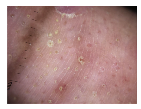
Figure 2 Dermoscopic image showing oval depressions and pits filled with yellowish plugs, peripheral scaling, linear vessels in a background erythema.