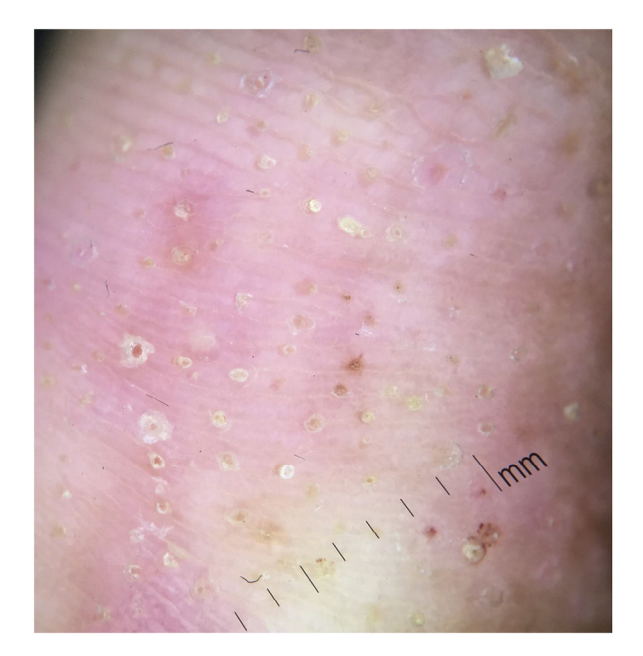
Figure 3 Dermoscopic image showing finger lesions with punctate hemorrhages along with pits.

Figure 2 Dermoscopic image showing oval depressions and pits filled with yellowish plugs, peripheral scaling, linear vessels in a background erythema.