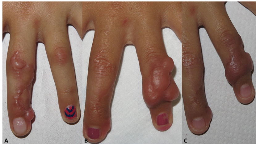
Figure 1 Patient 1. A, Indurated plaques on the third finger of the right hand. B, Recurrence on the fourth finger after intervention. C, Partial response after 1 year of steroid infiltration and clinical observation.

The second patient was a healthy 1-year-old boy who presented with a congenital soft-tissue tumor that was located on the third toe of the left foot and had grown progressively (Fig. 2A). Despite undergoing 2 surgeries in another center, including complete amputation of the third finger, the lesion had recurred after a few months (Fig. 2B). The patient was