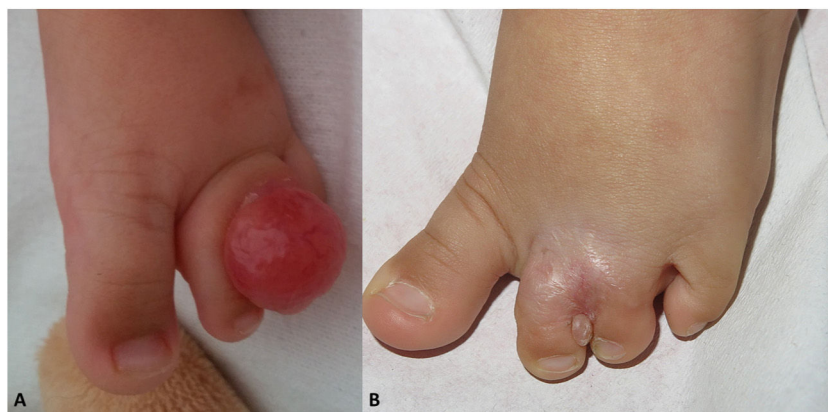
Figure 2 Patient 2. A, Indurated pink nodule between the second and third toes of the left foot. B, Recurrence several months after complete excision and digital amputation.