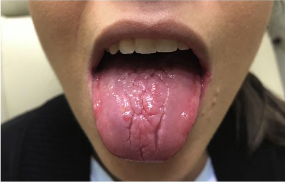
Figure 3 Improvement after 10 days of treatment with acyclovir. The patient's symptoms completely subsided after this treatment period.