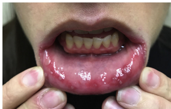
Figure 1 Multiple 2–5-mm shallow ulcers with an erythematous base on the patient's lower labial mucosa and lateral borders of her tongue.

A bacterial culture showed normal oral flora. A Tzanck smear of the ulcers showed numerous multinucleated giant cells. A second sample from the dorsum of the tongue showed the same cells in small numbers. Due to the presence of mucosal ulcers, deep tongue fissures and intense pain and a positive Tzanck smear, the patient was diagnosed with herpetic stomatitis and geometric herpetic glossitis. HIV test was nonreactive, complete blood cell count, C-reactive protein, serum immunoglobulins and blood chemistry were