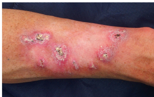
Figure 1 Keratoacanthoma marginatum centrifugum. Dome-shaped keratinizing pink to skin-colored nodules 1 to 2 centimeters in diameter with a central keratotic plug, distributed at the periphery of the previous radiation field (left forearm).

Patient 2 was an otherwise healthy 38-year-old male who developed a rapidly growing KA measuring 13 mm on the nose. His father had died at age 53 after developing metastatic colon cancer. MMR immunohistochemical