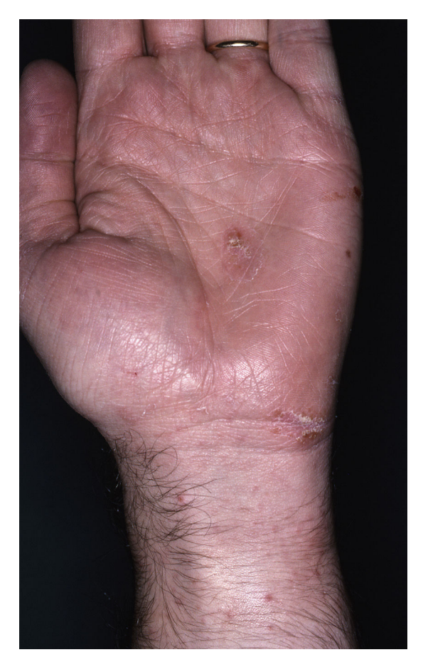
Figure 1 Scabietic burrows and nodules in volar surface of the wrists.

Within twenty-four to seventy-two hours after the administration of oral ivermectin, eleven patients (47.8%) presented new cutaneous lesions that were clinically distinct from those characteristic of scabies. The skin eruptions appeared after receiving the first oral ivermectin dose in 9 patients, after receiving the second dose in 1 patient, and after both the first and second dose in 1 patient. In all of the cases, the eruptions were characterized by itchy, scaly erythematous eczematous plaques located on the trunk and