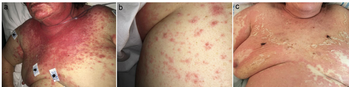
Figure 1 Clinical evolution. (a) Exanthema affecting mainly face, upper trunk, superior limbs with isolated patches on abdomen and lower extremities. (b) Closer image showing isolated pustules surrounded by erythema. (c) Evolution of the exanthema 5 days after Sorafenib discontinuation. Mild erythema and desquamation on upper trunk with pustules resolution.

Laboratory examination revealed a hypereosinophilia of 1.4 \times 10^9/L . A skin biopsy was performed, rendering typical histological features of AGEP (Fig. 2). Attending to the validated EuroSCAR scoring system, 2 our case was then classified as a Probable AGEP. Sorafenib was discontinued immediately, and treatment with intravenous methylprednisolone 1 mg/kg was initiated. Cutaneous lesions improved