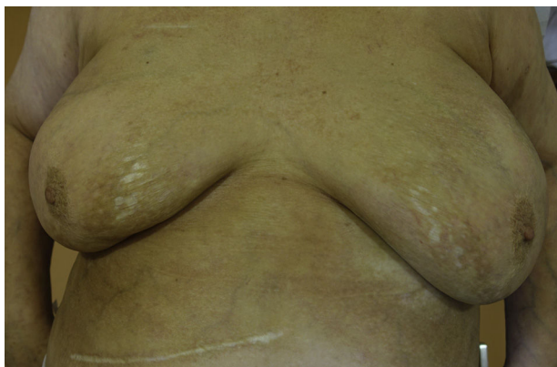
Figure 1 Patches in both breasts and left inframammary fold, showing a shiny white color, lilaceous ring and atrophic surface.

A 65 year-old woman came to our clinic referred by the Oncology department of our hospital. She was being followed due to a stage IV lung adenocarcinoma for which she had received different therapies. Just 2 months after initiating treatment with Nivolumab (3 mg/kg every 2 weeks), she developed cutaneous lesions on the trunk. On the physical examination she presented three patches: one on each breast, and one on the left inframammary fold (Fig. 1). These lesions had a shiny white color with a discrete lilaceous ring. To the touch, they presented as clearly atrophic. She reported occasional itching but no other