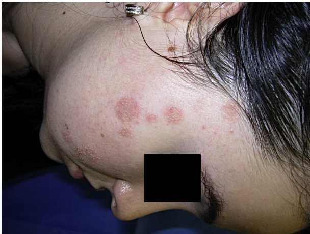
Figure 1 Faint erythematous and eroded impetiginized patches on the right cheek and temple.