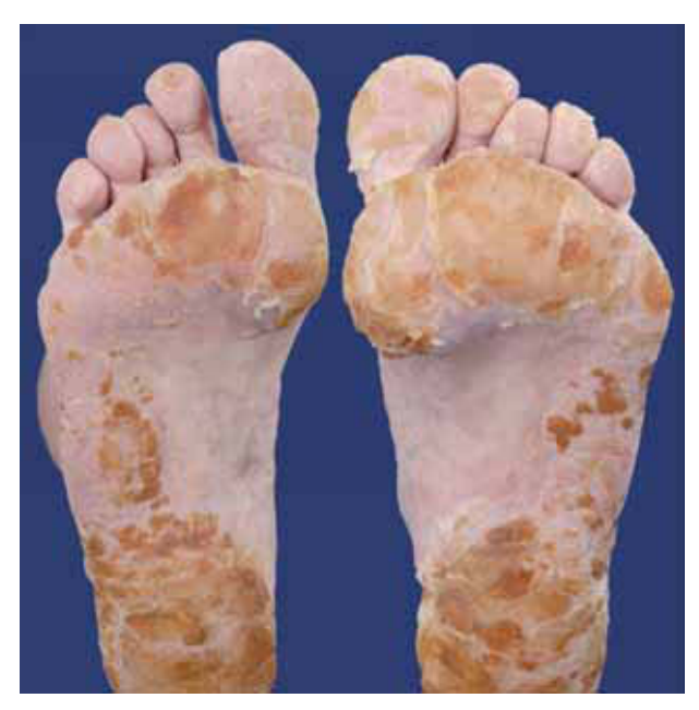
Figure 3. Paraneoplastic plantar hyperkeratosis in a patient with a laryngeal tumor.

it; dermatologists. This is again a typical case of 'referral delay', caused by overestimation of dermatological skills by non-dermatologists.