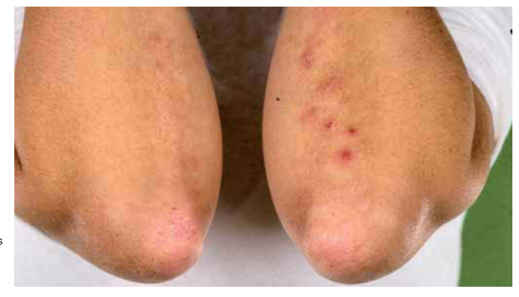
Figure 2. Dermatitis herpetiformis of the elbows, with typical excoriated lesions in different stages of healing. Vesicles are only rarely observed.

Dermatitis herpetiformis is a relatively rare skin disease. It is very unusual that non-dermatologists recognize the entity. The excoriated, minimally inflammatory lesions are often taken for 'eczema', 'mycosis', or skin infection, which is often as far as the differential diagnosis by non-dermatologists in erythematous and itchy skin conditions goes. It is evident that the quality of care initially provided here was below standard due to the lack of recognition which is, by definition, only in the hands of those that specialize in